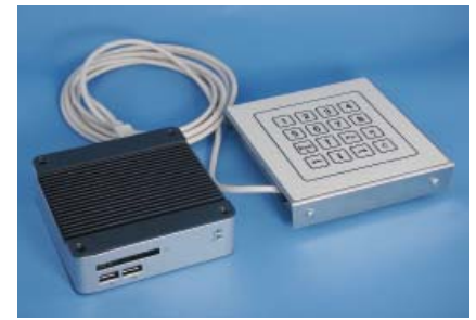
E-PAD Controller & Keypad

Connect up to 8 E-PAD units as required for your system, using the optional E-PAD Router.