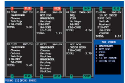
Key Item Summary