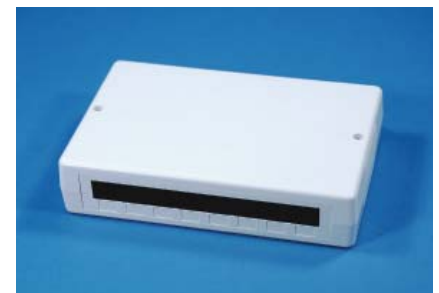
Optional E-PAD Router