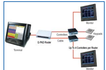
Easy to Install Configuration